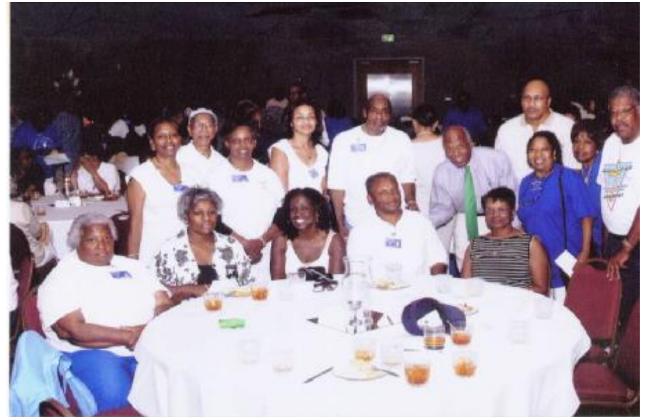
Class of 1962