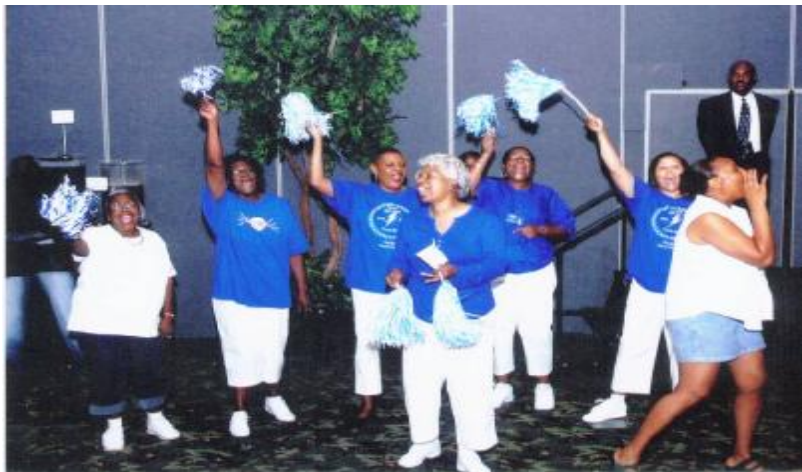
The Cheerleaders "rally" up that old Thunderbolt Spirit