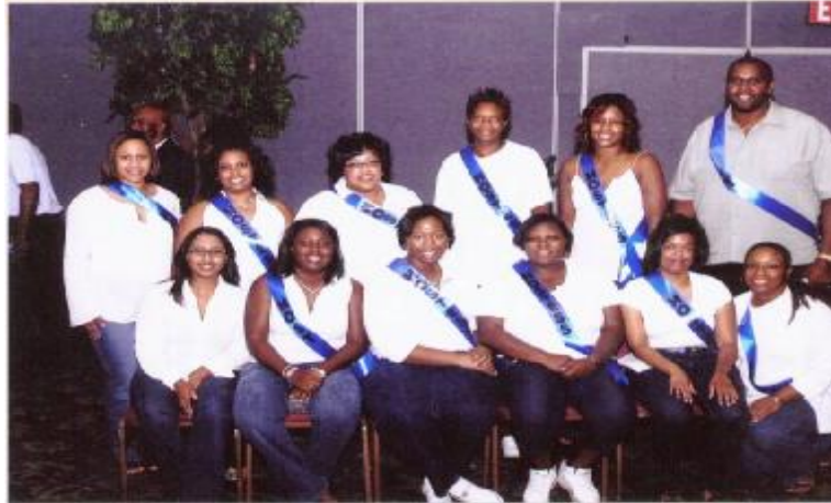
Thank you for a job well done.